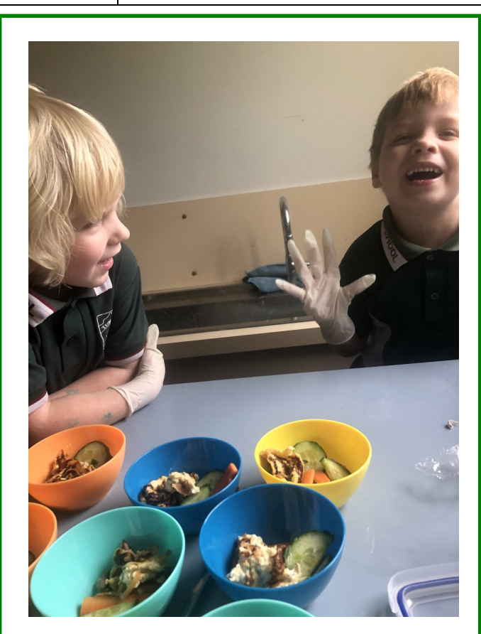
Last week's veggie chefs. Delicious!