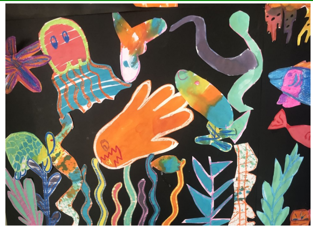
Under the Silver Sea artwork