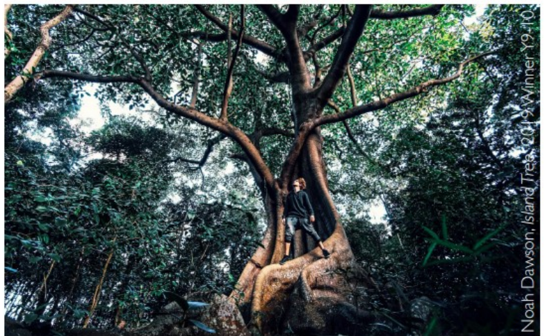
Noah Dawson, Island Trees 2019 Winner Y9-10