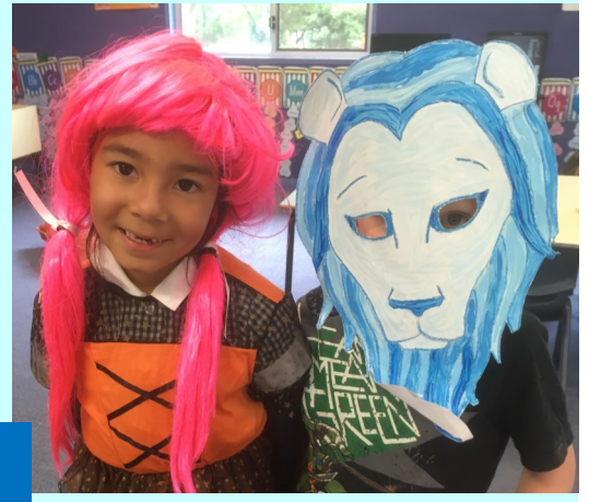
Kindy orientation Dress up fun!