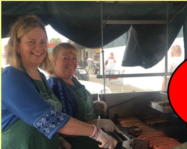
Bunnings sausage sizzlers! These were just some of the helpers.